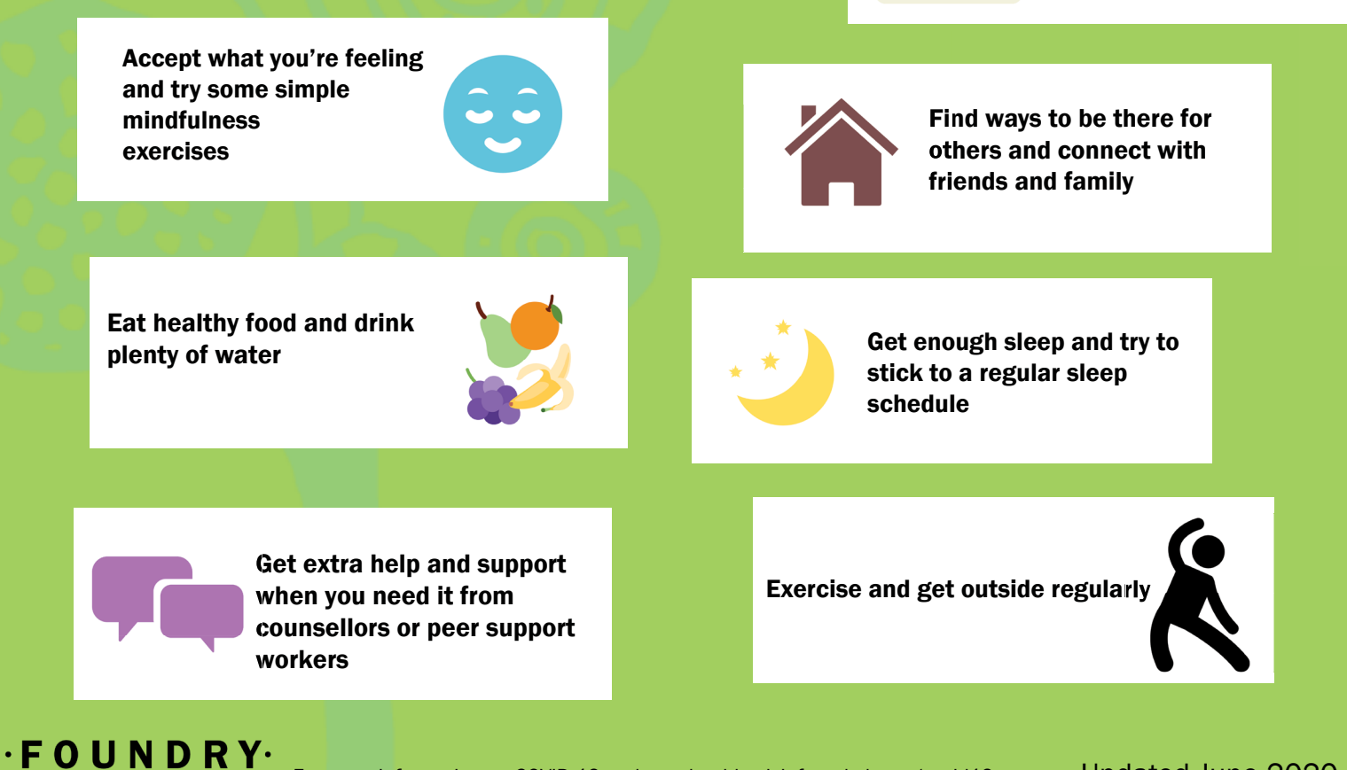
Set aside time for yourself and practice self-care.

For more information on COVID-19 and your health, visit foundrybc.ca/covid19 Updated June 2020